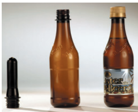
PETN bottles with Amosorb oxygen scavenging copolyester offer convenience to bottler Bowen & Bowen and its consumers.