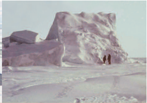
Broken ice and ice ridges are some of the conditions encountered in the Sakhalin region, offshore eastern Russia, where BP plans to develop hydrocarbon resources