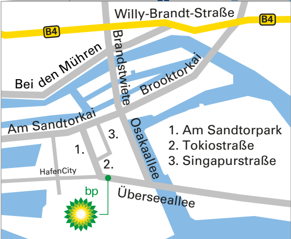
BP building location map