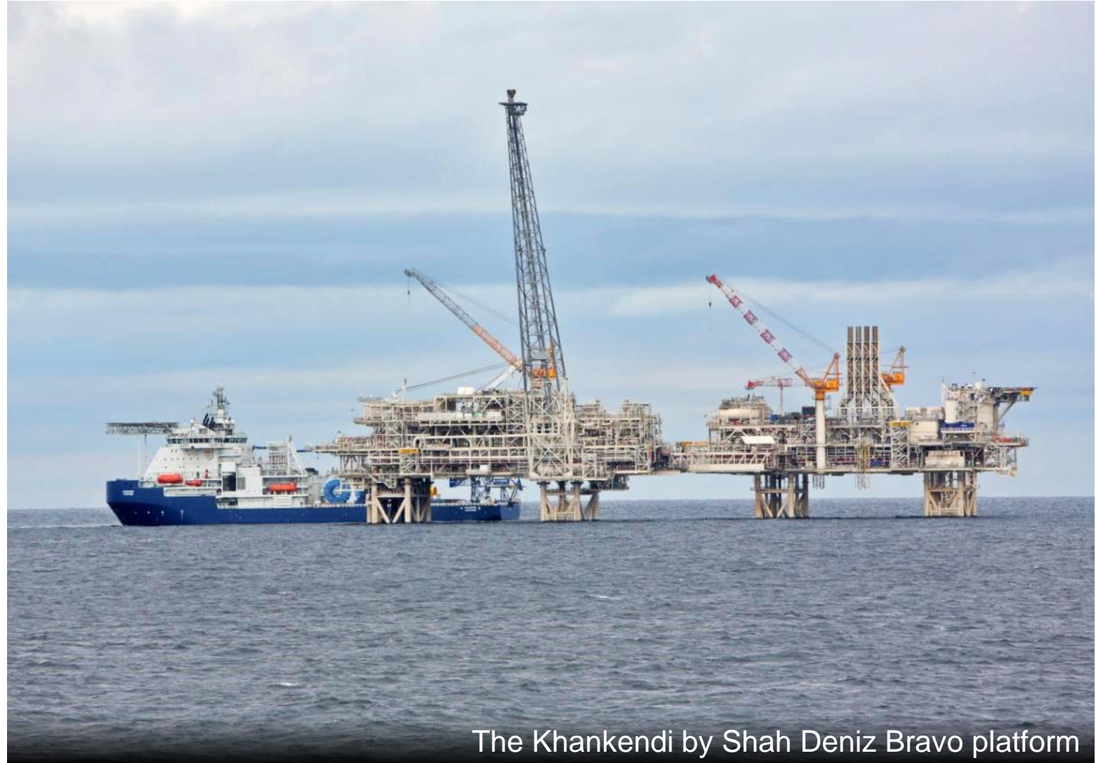
The Khankendi by Shah Deniz Bravo platform