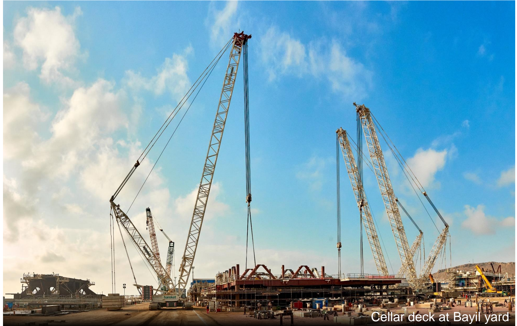
Cellar deck at Bayil yard