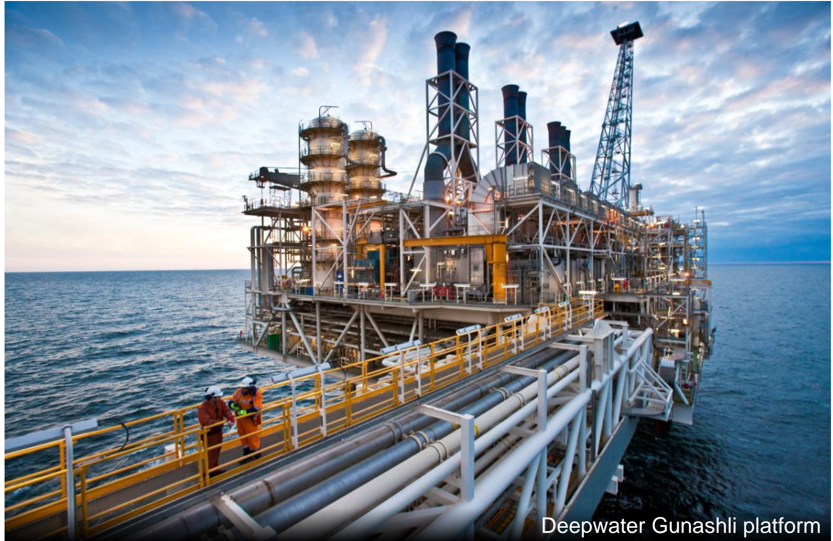
Deepwater Gunashli platform