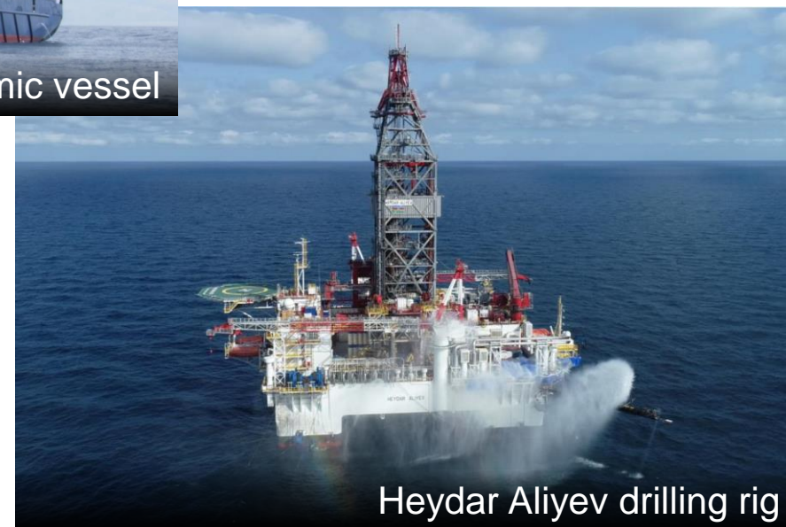
Heydar Aliyev drilling rig