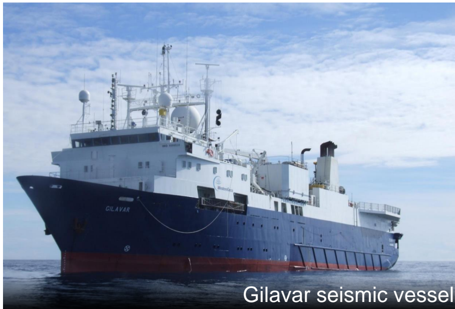
Gilavar seismic vessel