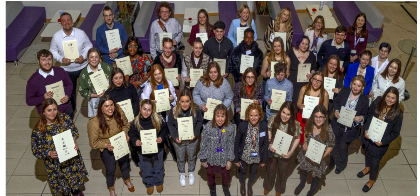
Above: bp tutoring scheme recognition awards 2022