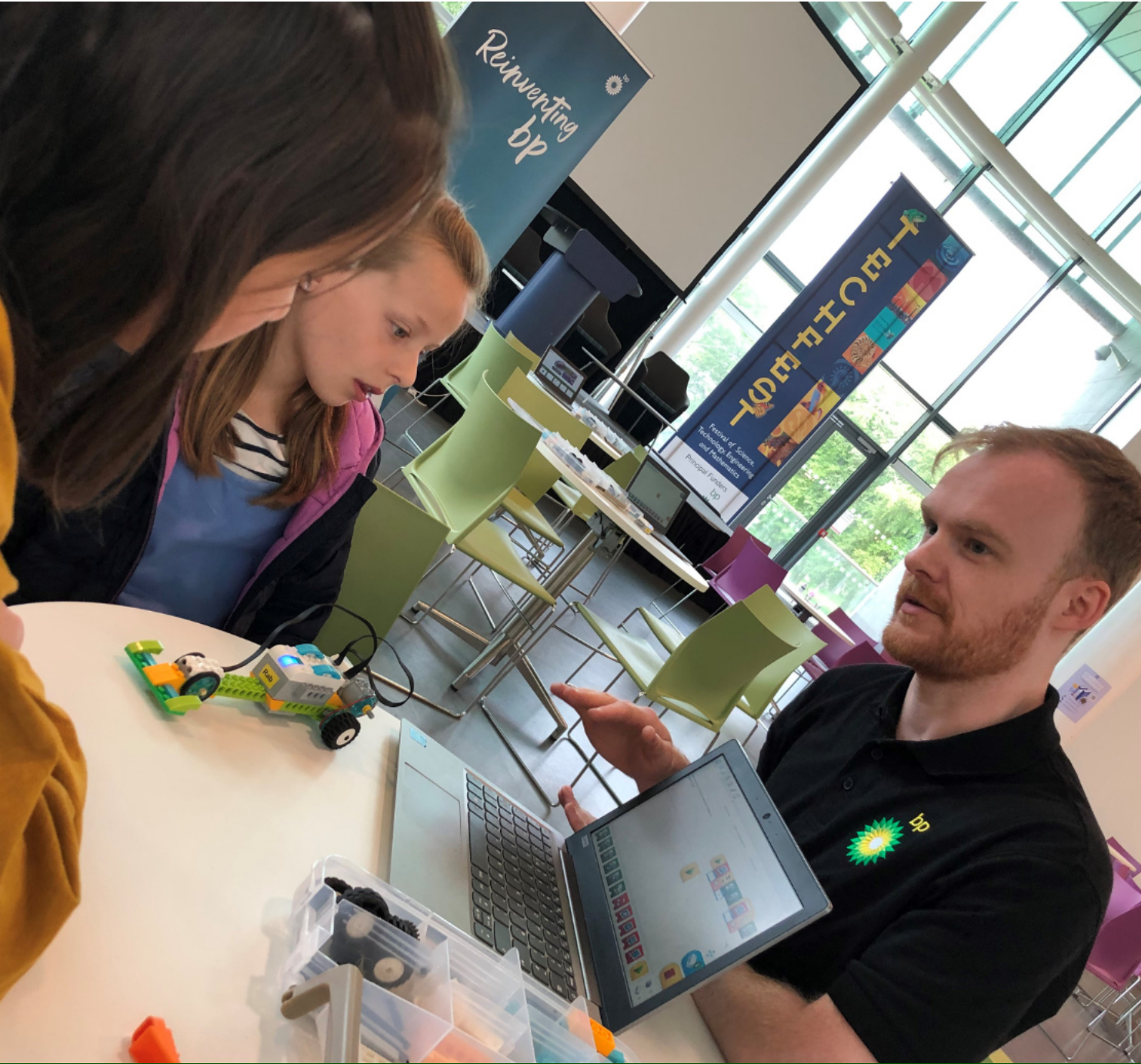
bp at TechFest Aberdeen