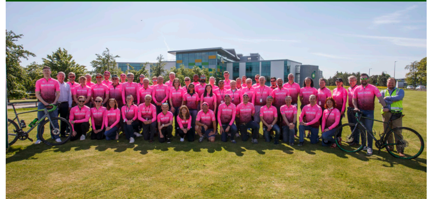
Below: Coast 2 Coast cyclists 2022