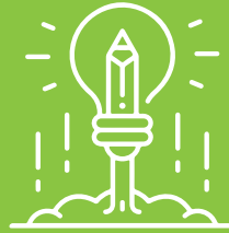
Livelihood and Papuan entrepreneurship