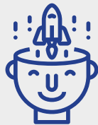
Livelihood and Papuan entrepreneurship