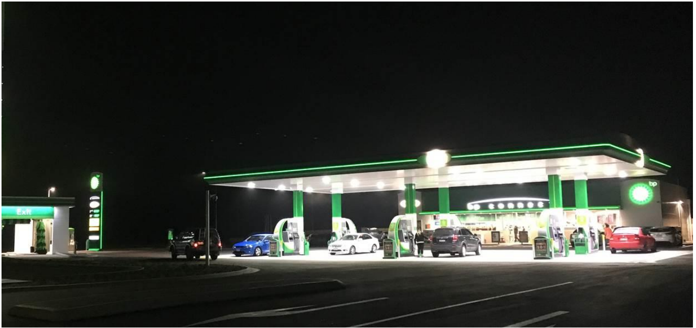
BP Connect Ravenswood open for business