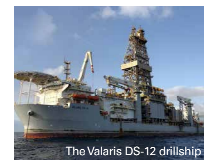
The Valaris DS-12 drillship

Once all four wells are drilled and suspended, the drillship will complete and test each well.