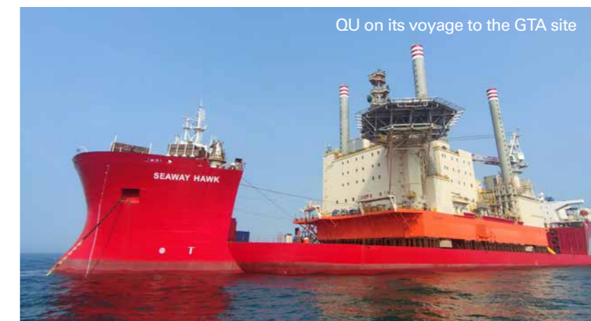
QU on its voyage to the GTA site