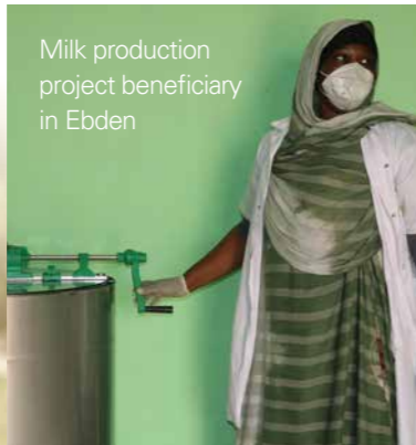
Milk production project beneficiary in Ebden

“Before you came to support us, we were just sitting home doing nothing, today we have our own business! We produce milk, package it, and then sell to local small stores. We are grateful for this project that’s very beneficial for women in Ebden”