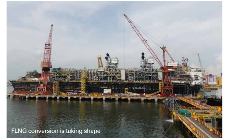
FLNG conversion is taking shape

In Batam, Indonesia over 300km of linepipe, weighing over 105,000 tonnes, has been produced and is arriving in the region to form the subsea system.