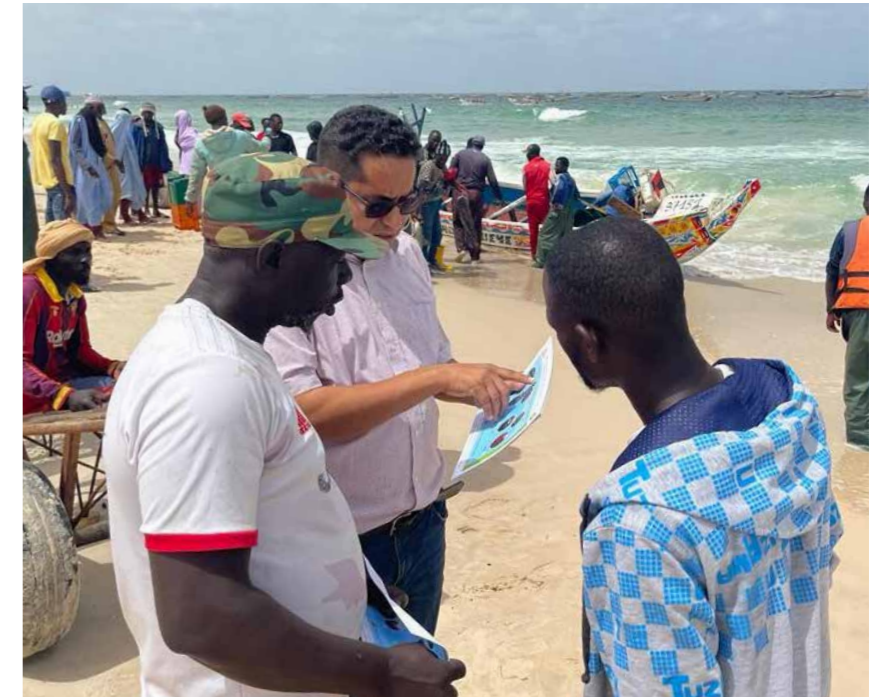
Engagements with the fishing communities in St Louis and N'diogo