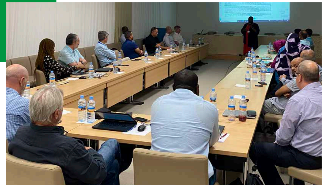
Local supplier awareness - safety session

Earlier this year we launched the supplier registration portal on our internet sites to promote potential opportunities in a simple and transparent manner. We also host local supplier awareness