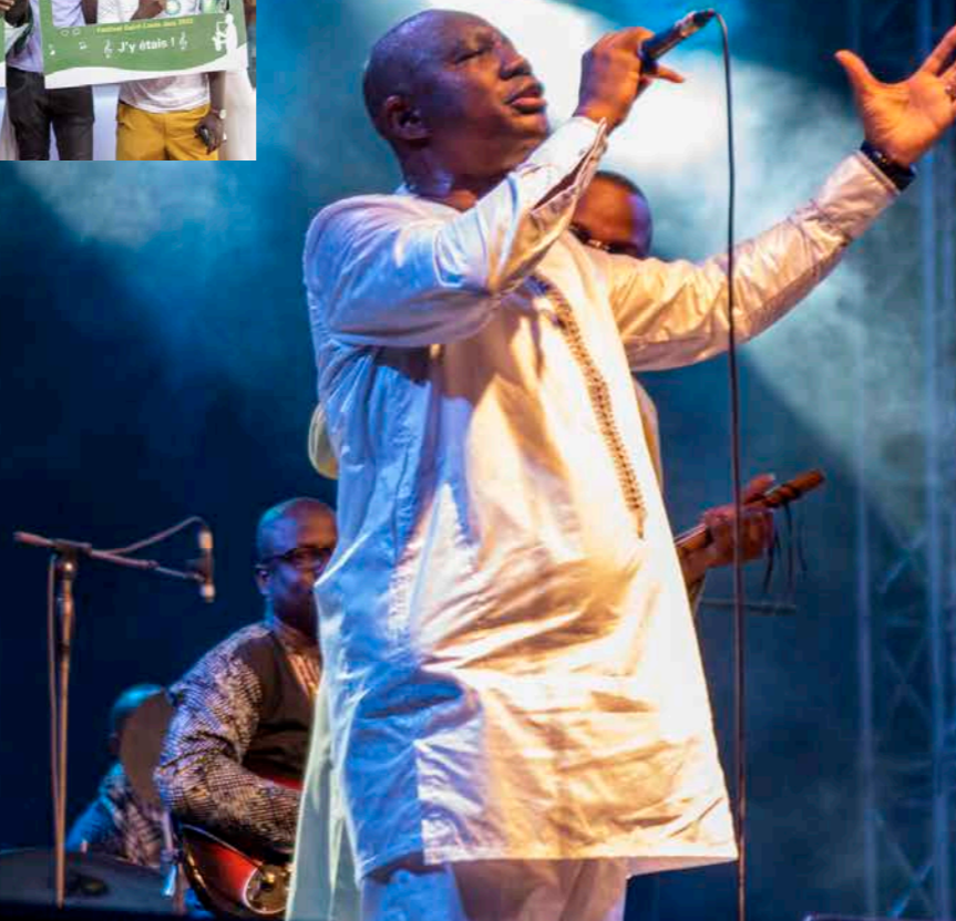
Performers and guests at the bp stand at St Louis Jazz Festival