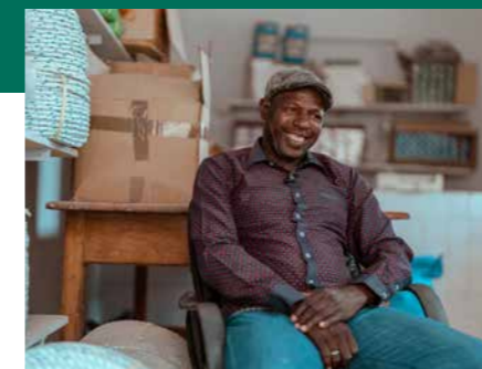
Economic activities, St Louis