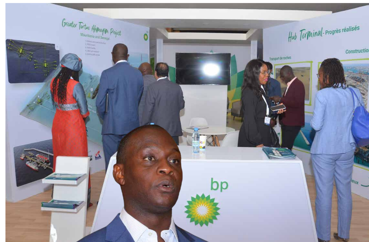
The bp stand at MSGBC