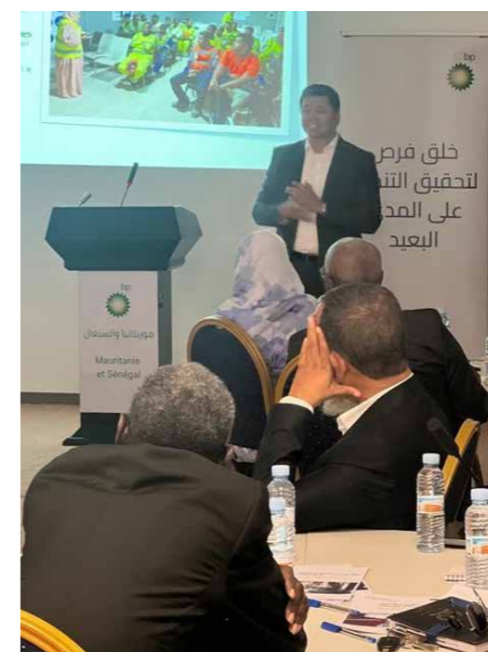
Participants at the workforce development workshop